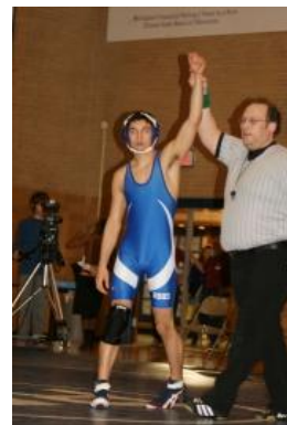
2005 IKWF Sectional Qualifier RBHS Team Co-Captain IHSA State Qualifier 2009