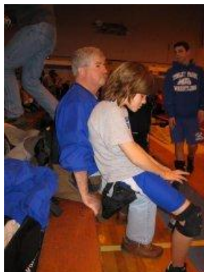
2007 IKWF Sectional Qualifier IHSA Regional Champ 2009