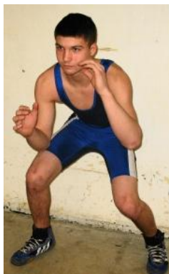
2008 IKWF State Qualifier