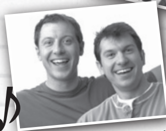
The Kratt Brothers June 12